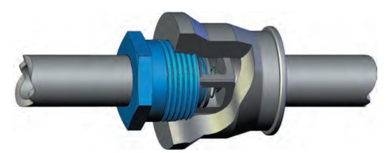
Can be used with reducing coupling